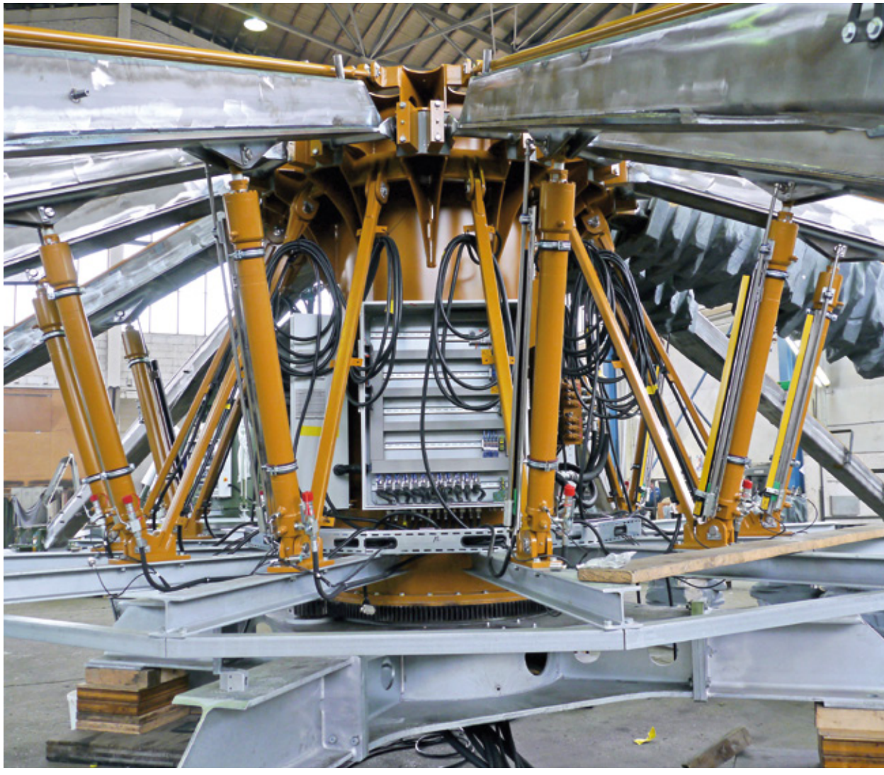
Instead of having to use five proximity switches for each hydraulic cylinder, a 1,000 mm linear position sensor from Turck now supplies the exact position of the arm

A solution using linear position sensing was considered in October 2011. Zierer looked for a linear position