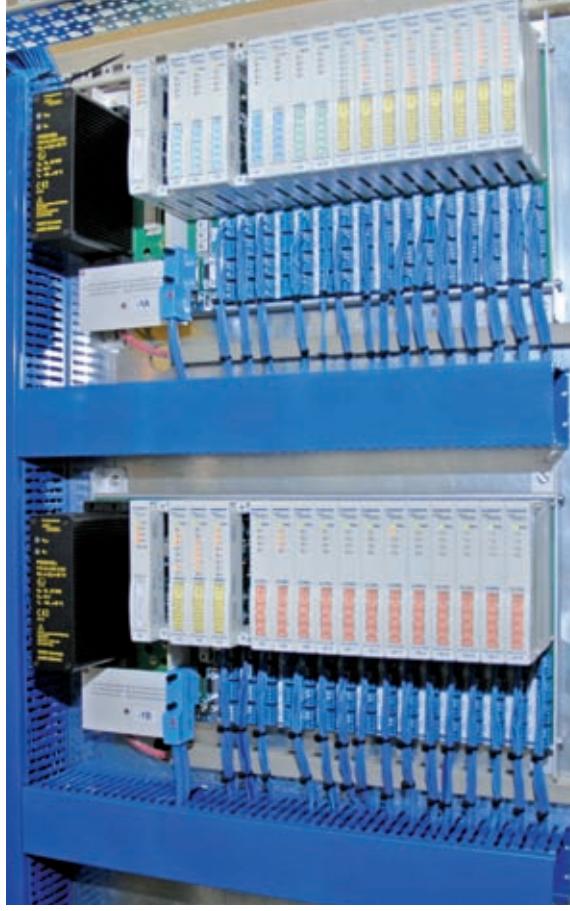
In only one weekend, EAB Automation installed the new excom systems into the 19" racks