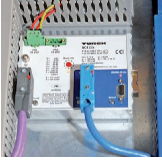
The SC12Ex segment coupler is used for intrinsically safe separation of RS485 and RS485-IS

Even though the remote-I/O system wasn't installed in a hazardous area for this project, it is possible to install excom in zones 1 and 2. The field circuits are approved for the use up to zone 0. The IP20 rated I/O modules offer four analog or four to eight binary inputs or outputs at a width of 18.2 mm. Two redundant power supplies, two redundant gateways and up to 16 E/Amodules can be installed on an area of 43.2 cm by 20.6 cm by 11 cm. In this configuration, up to 128 binary or 64 analog channels are available in a very small space.