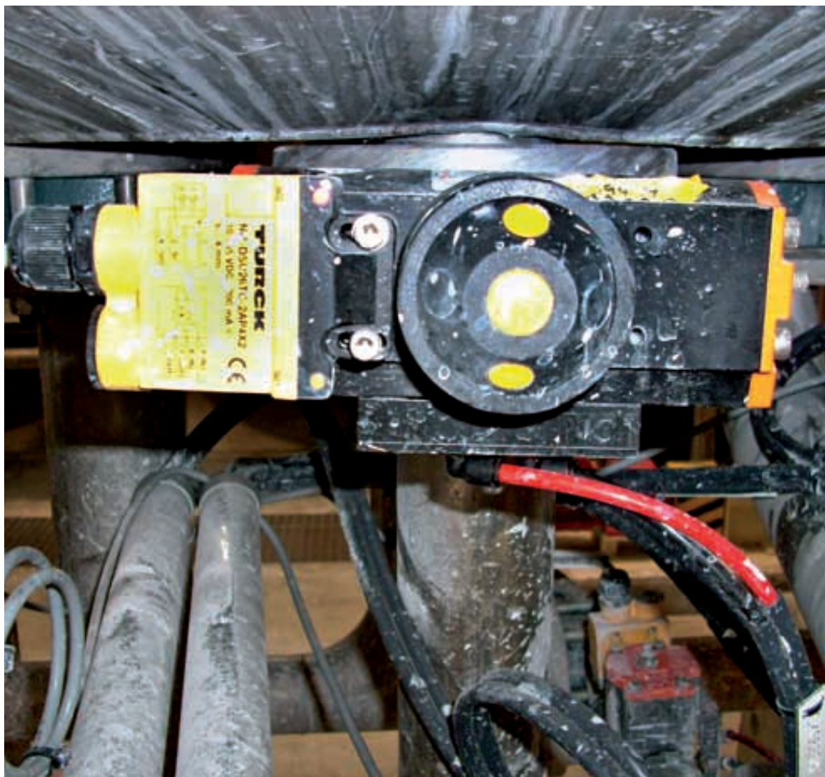
Even dirt or moisture can't harm the encapsulated dual sensor

tion for the final surveillance of their instruments. Turck was the answer for the pneumatic valves.